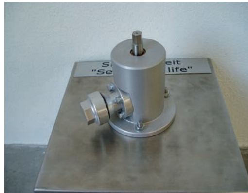
Gas recovery device mounted on the surface – ready for drilling